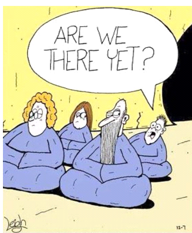
On the family trip to nirvana